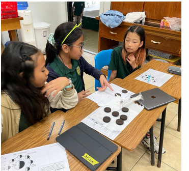
5th and 6th graders exploring lunar cycles with Oreos!