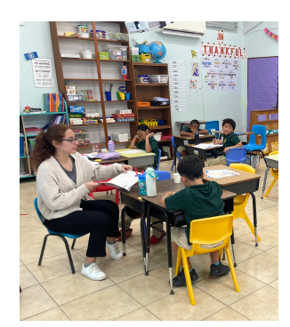
1st and 2nd Grade are doing class work.