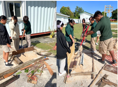
The 7th and 8th graders are engineering a dam for their latest mission!