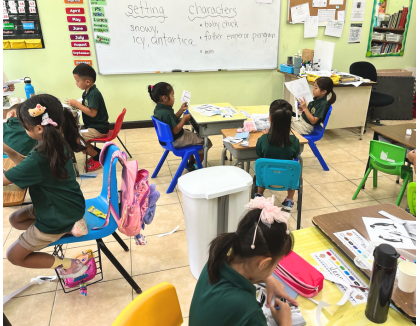
Let's dive into the magical world of kindergarteners exploring story settings and characters!