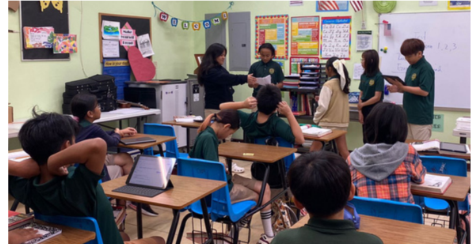
Grades 5 & 6 were having a short skit about the Transcontinental celebration.