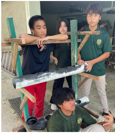
Grades 7 & 8 assembled the frame for the future hydroponics system and small fish pond.