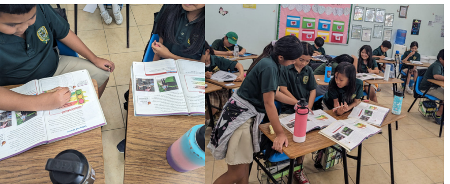
Grades 3 & 4 creating street signs to help others in the community as part of their Civics unit.