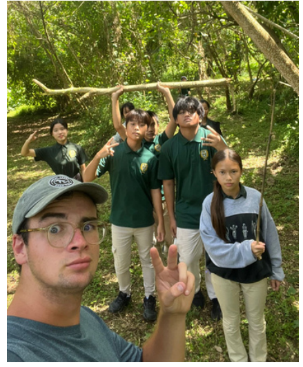
Grades 7 & 8 are in a jungle expedition with Mr. G!