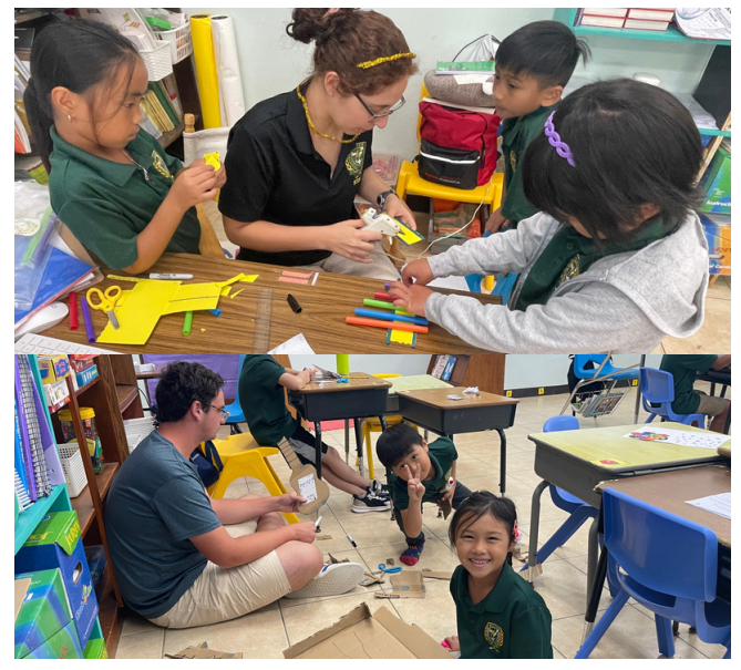
Grades 1 & 2 are being creative making different kinds of instruments!