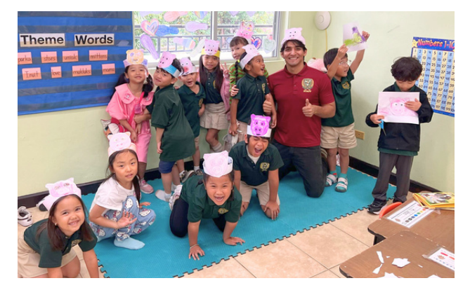
The Kindergarten class studied the story of the prodigal son, so they made pig hats!