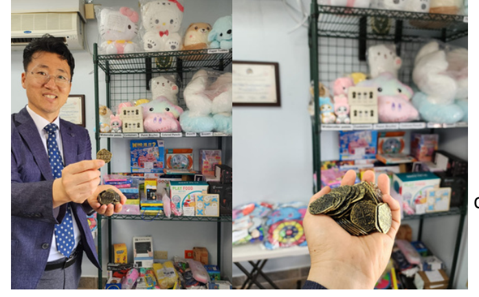
Pastor Song with the SDA Coins, more details coming soon!