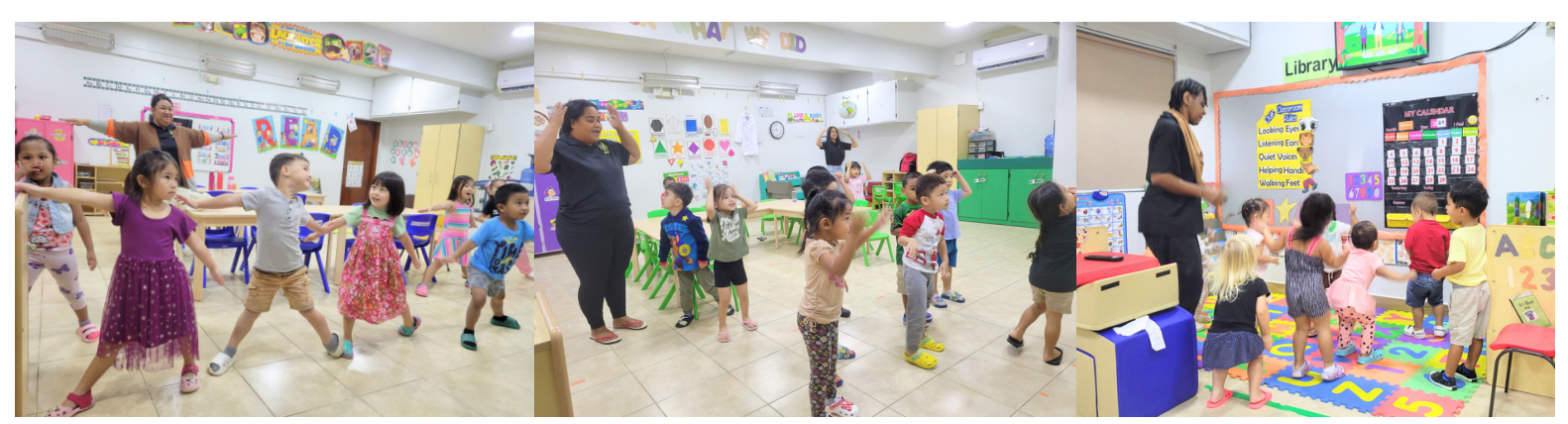
Here are our CDC students enjoying their morning exercise with their teachers. This daily morning routine will help our students with their physical well-being and warm them up for another day of learning and growth.