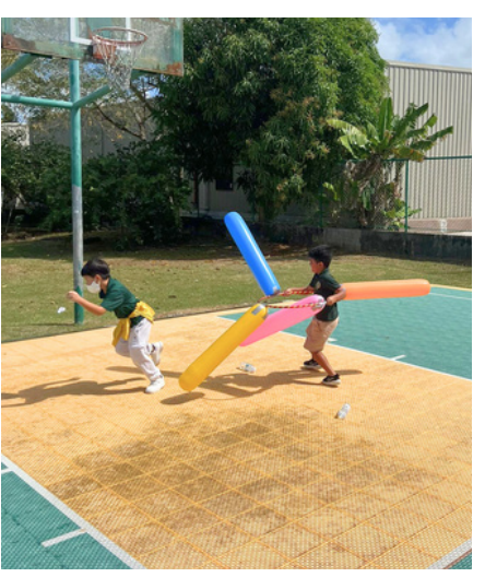
The Kindergarten students playing Octopus Tag during their Physical Education class.